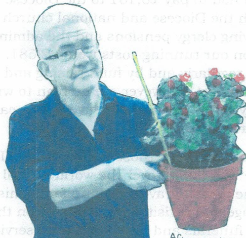
After a photo by Ruth Bourne